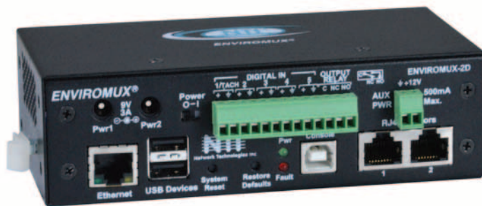
ENVIROMUX-2D (Front & Back)