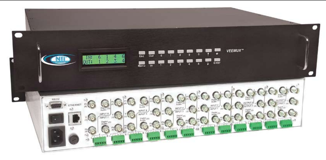
VEEMUX® SM-8X4-HDA (Front & Back)