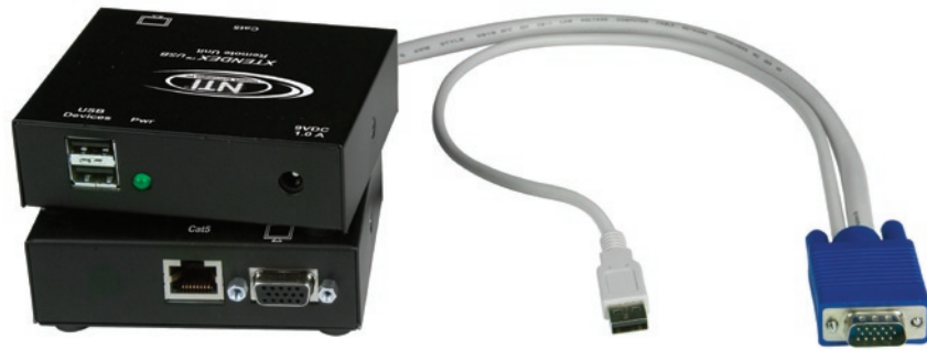
XTENDEX® ST-C5USBV-300 (Remote and Local Units)